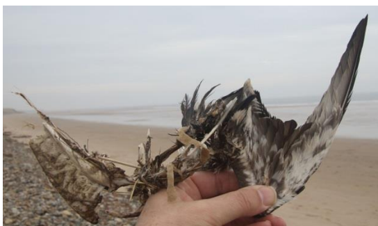
(Left) Immature guillemot remains, showing right underwing and sternum. Druridge Bay, 29 Mar 2017.