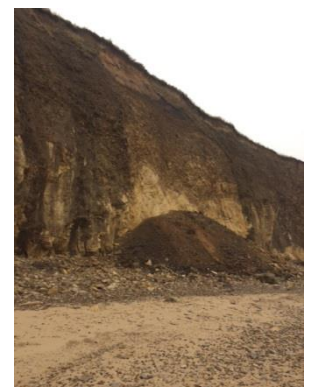
(Right) Landslide at north end of Marsden Bay, Tyne and Wear.