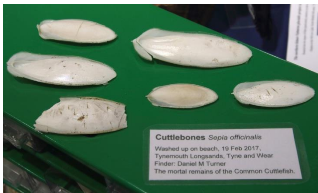
(Left) Cuttlebones on display at the Old Low Light, 23 Feb 2017. They were collected on the beach at Tynemouth four days earlier.