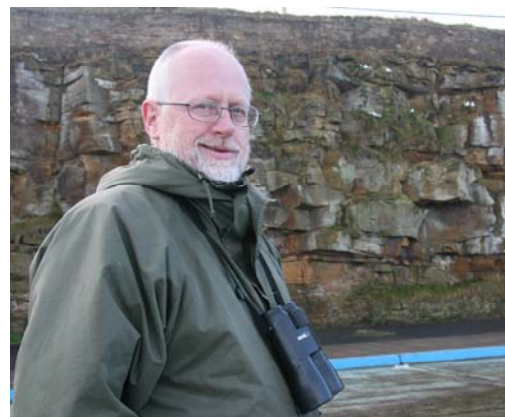
10. Whitley Bay Fulmar colony, January 2009.