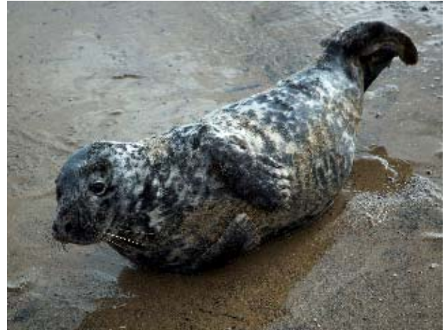
Photo 3. Beached young Common Seal ( Phoca vitulina ), Seaham to Ryhope, Durham, 9 March 2008. Thought to be up to six months old. Moved to Tees Seal Rescue Centre.

1. Northern Fulmar ( Fulmarus glacialis ), Hartlepool North Sands. Specimen NEE-2008-018, died soon after finding.