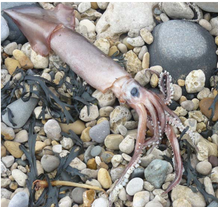
Photo 4. Common European Squid ( Loligo vulgaris), Seaham to Ryhope beach, Durham coast, 13 March 2009.